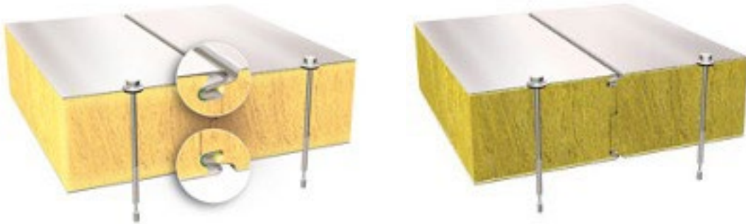
Figure 1. An example of an SPA panel with a mineral wool insulation core.

Ruukki has the right to use CE marking for sandwich panels (EN 14509). By affixing CE marking to a product, the manufacturer indicates that the product conforms to all relevant legislative requirements, in particular to health, safety and environmental protection requirements.