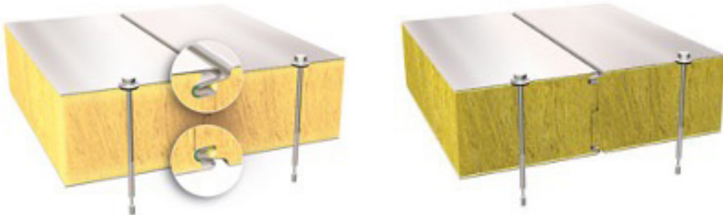
Figure 1. An example of an SPA panel with a mineral wool insulation core.

Ruukki has the right to use CE marking for sandwich panels (EN 14509). By affixing CE marking to a product, the manufacturer indicates that the product conforms to all relevant legislative requirements, in particular to health, safety and environmental protection requirements.